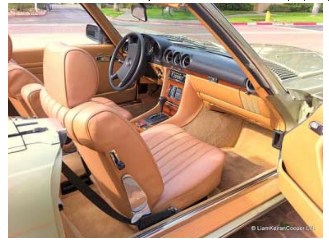
1981 Mercedes 380 SL Roadster - only 39,000 Miles! 111 P...

http://palmsprings.craigslist.org/cto/2201827763.html