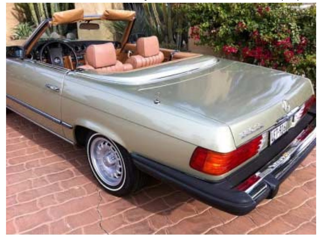
1981 Mercedes 380 SL Roadster - only 39,000 Miles! 111 P...