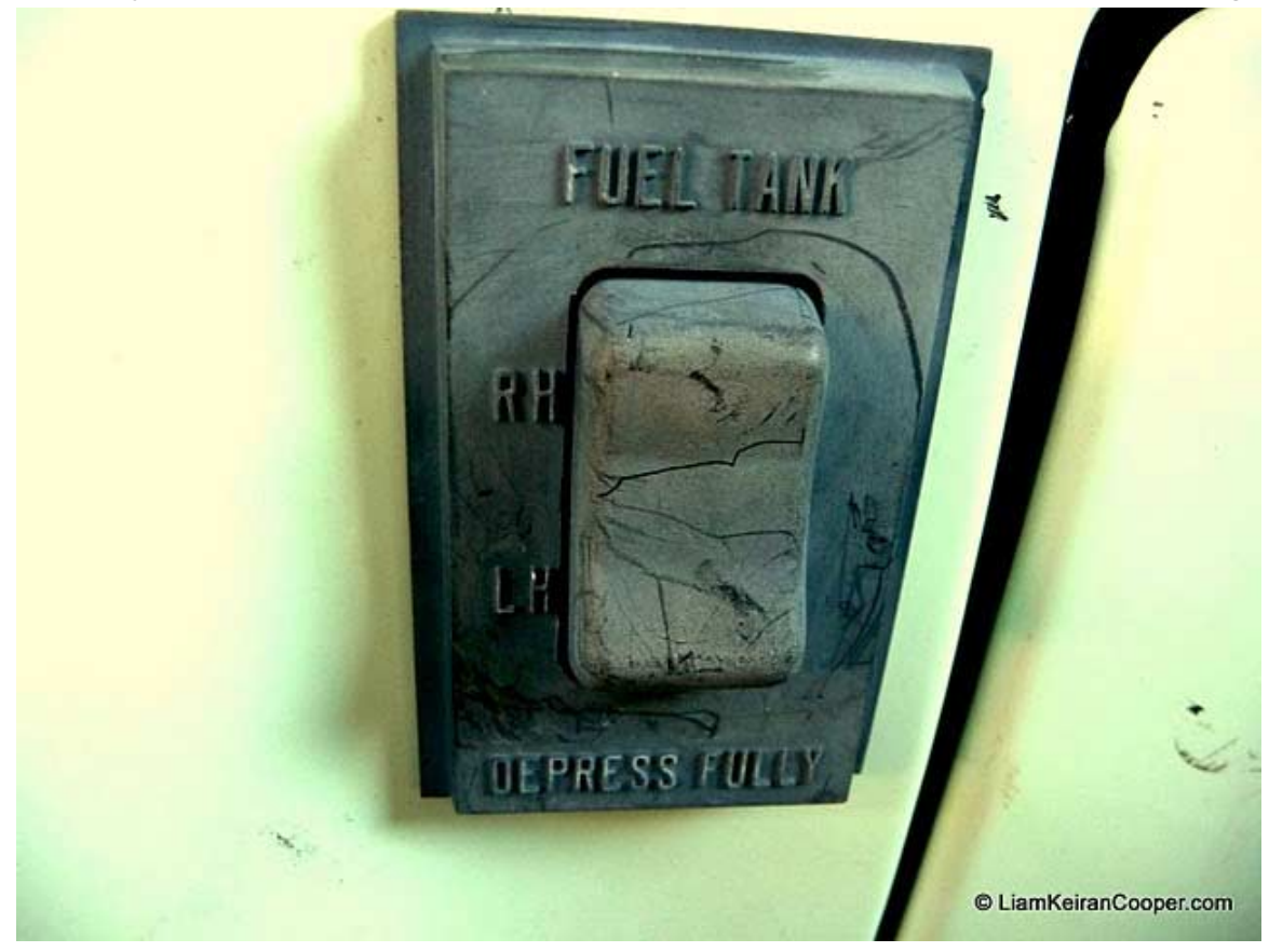
1985 Chevy C-20 Pickup, Perfect Condition, 51 Pictures

http://dallas.craigslist.org/dal/cto/2135061683.html