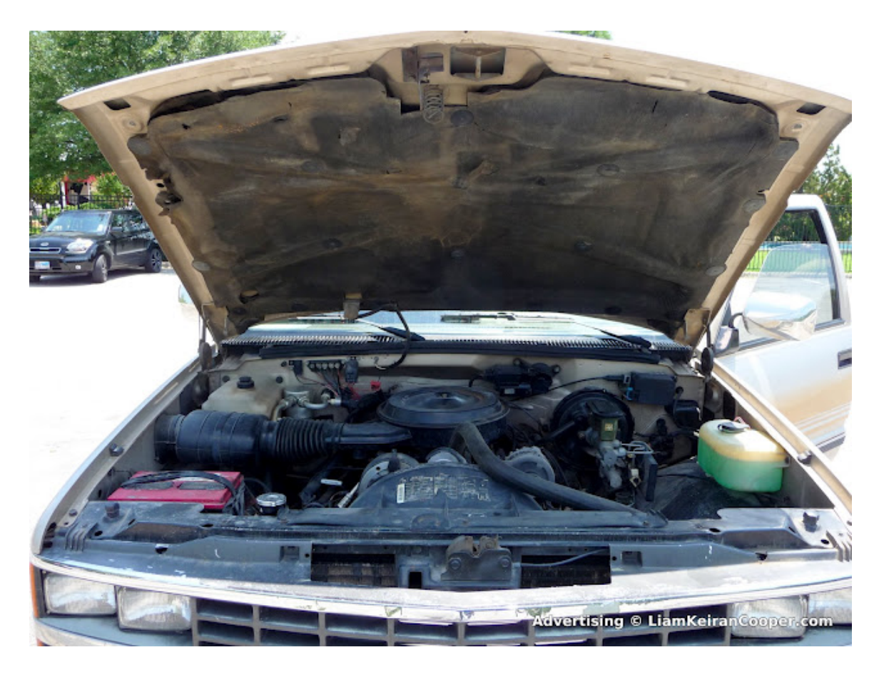
1840 since Thu 21 JUN 2012 at 1400